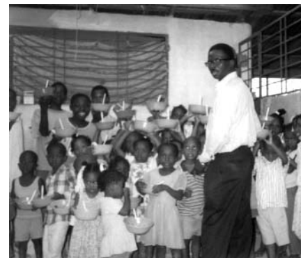
“He that hath pity upon the poor lendeth unto the Lord;” Proverbs 19:17