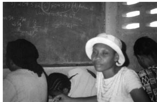
Children are taught in the mornings. Adults learn to read and write in the afternoon!