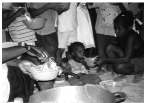
A child fed is a life saved!

Editor’s Note: Please overlook any poor grammar or spelling in the above letter. I wanted to share the note from this great pastor in his own words.